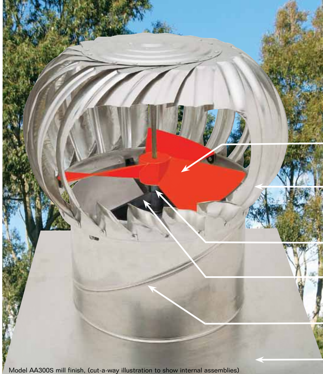
Model AA300S mill finish, (cut-a-way illustration to show internal assemblies)

It all adds up to Superflow being one of the most desirable eco-friendly home comfort products you can buy. It's an investment in energy conservation.